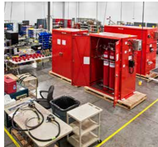
Before your system arrives, our experts define, engineer and integrate your solution.

“We use Det-Tronics for their expertise for fire and gas mapping. The big benefit is the peace of mind knowing that the detection equipment is located properly.”— Plant Manager, Natural Gas Processor