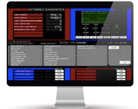
Safety system software provides real-time status and diagnostics.

The safety system software platform offers an all-in-one solution that is designed for easy configuration, user programming and diagnostics.