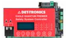
Eagle Quantum Premier® Safety System