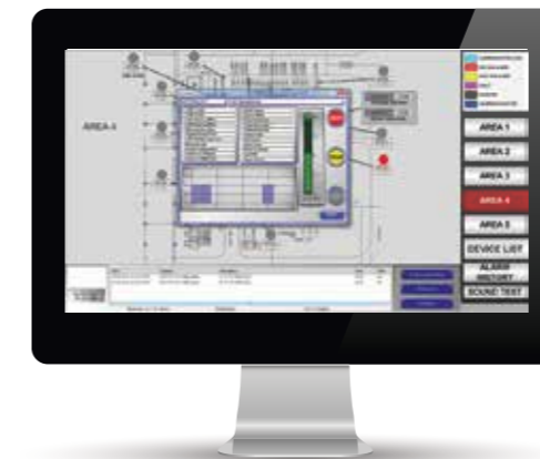
Integrate with existing site control systems such as SCADA, DCS and Process PLC