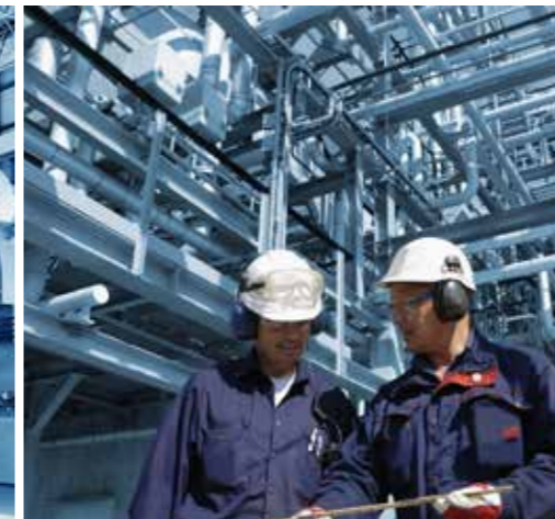
After your system is in place, our global network provides service, training, and support at your site.